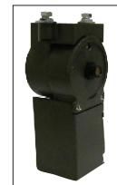
2AFPC with integral button photocell.