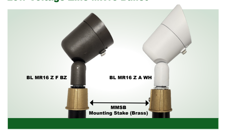
FINISH — A Super Durable Polyester powder coat finish is electrostatically applied. Standard colors available: Black, Bronze, White, or OD Green. Custom colors available upon request.