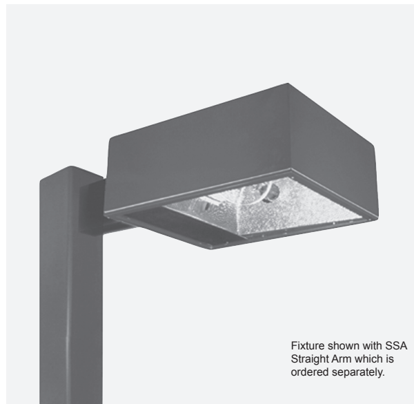
Fixture shown with SSA Straight Arm which is ordered separately.