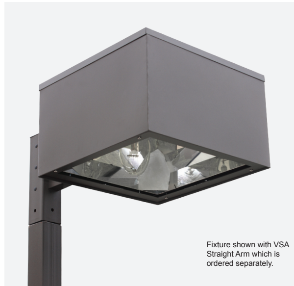
Fixture shown with VSA Straight Arm which is ordered separately.